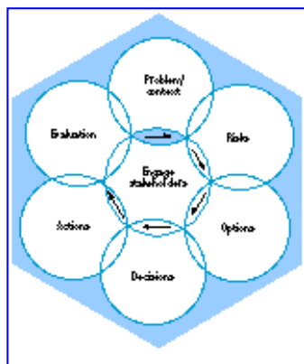
Figure 1. The Risk Commission's framework for environmental health risk management.

The 1990 Clean Air Act amendments also authorized a Commission on Risk Assessment and Risk Management, charged with the responsibility of developing a method for evaluating residual risks. In its final report to Congress in 1997 (1,2), the commission recommended a scheme for residual risk assessment as well as a framework for environmental health risk management. The framework is intended to improve the logic, consistency, and acceptability of decisions related to public health protection and environmental risk management and has six components (see Fig. 1): problem/context, risks, options, decisions, actions, and evaluation. One of the advantages of the framework is that instead of evaluating risks singly and in isolation from one another, they are evaluated in the context of the risk management decision to be made and in the context of public health. Evaluating residual risks in the context of public health requires a public health approach to risk management.